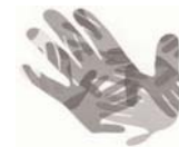
It's In Our Hands

A number of CCCs are already in place and more are forming each day. Those interested in organizing a committee should call their regional census center or visit www.2010.census.gov .