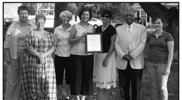
Representing the Bethel and Petsworth Full Service School Planning Teams, several members are present to accept their 2009 NACo Achievement Award.

Partnership Program: One of 15 programs recognized in Virginia by the Virginia Association of Counties, the Full Service School Project demonstrates an innovative model of how local government and schools partner together to meet the needs and challenges of school students and their families. The Gloucester Community Policy and Management Team is credited with implementation of this program in partnership with the Petsworth and Bethel Full Service School Planning Teams.