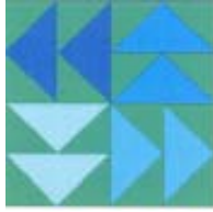
Exhibit and quilt telling the secrets of this legendary code. Location: Gloucester Visitor Center, 6509 Main Street. (804)693-0014. Free.